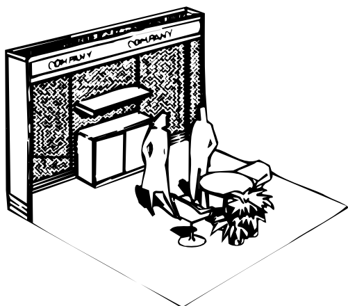
SOME ITEMS ILLUSTRATED ARE OPTIONAL